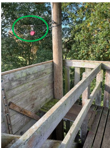
Access to Climb 1 top rope across hatch

Climbs 2,3,4 can be accessed directly from the platform at the top of the tower.