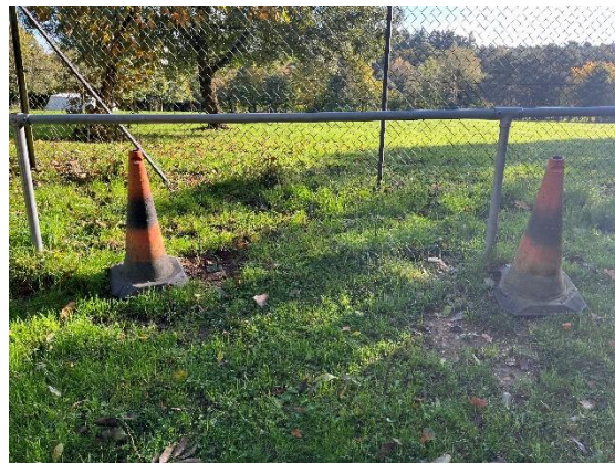
Ground anchors for climbs 1,2,3,4