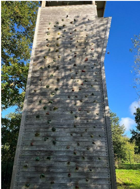
Climbs 1 and 2 on a straight wall