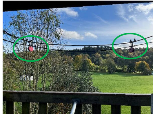
Climbs 3 (right) and 4 (left)