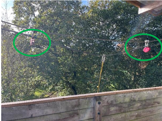
Climbs 1 (right) and 2 (left)

To set up the top ropes for climbing the climbing instructor must be wearing their harness and helmet, and be connected to a safety line at the top of the tower. The top rope for climb 1 is accessed by standing on a hinged board that goes across the stairs used to access the top of the tower.