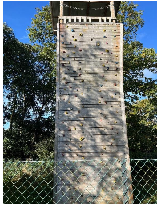
Climbs 3 and 4 on a straight wall with overhang